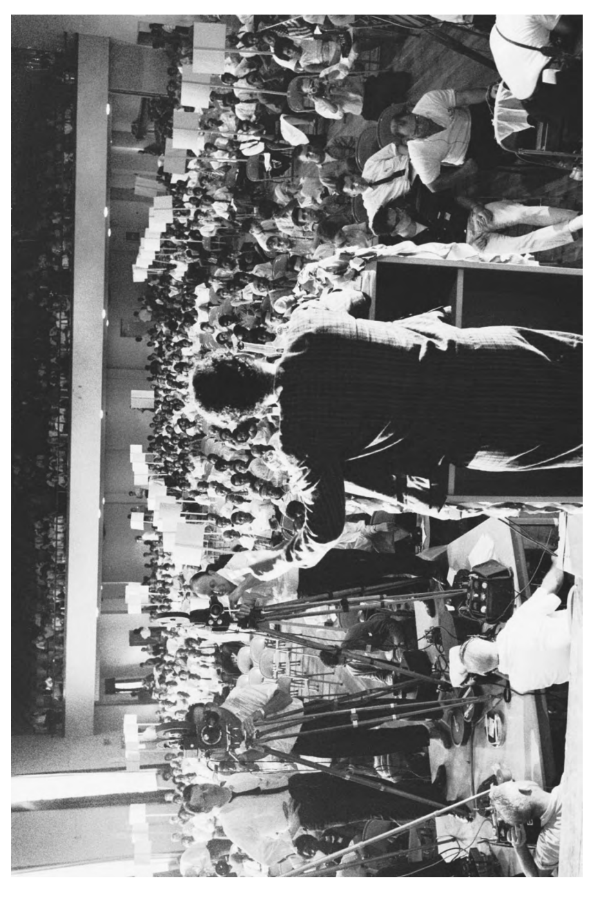
Baker addresses the MFDP State Convention, Jackson, Mississippi, 1964.